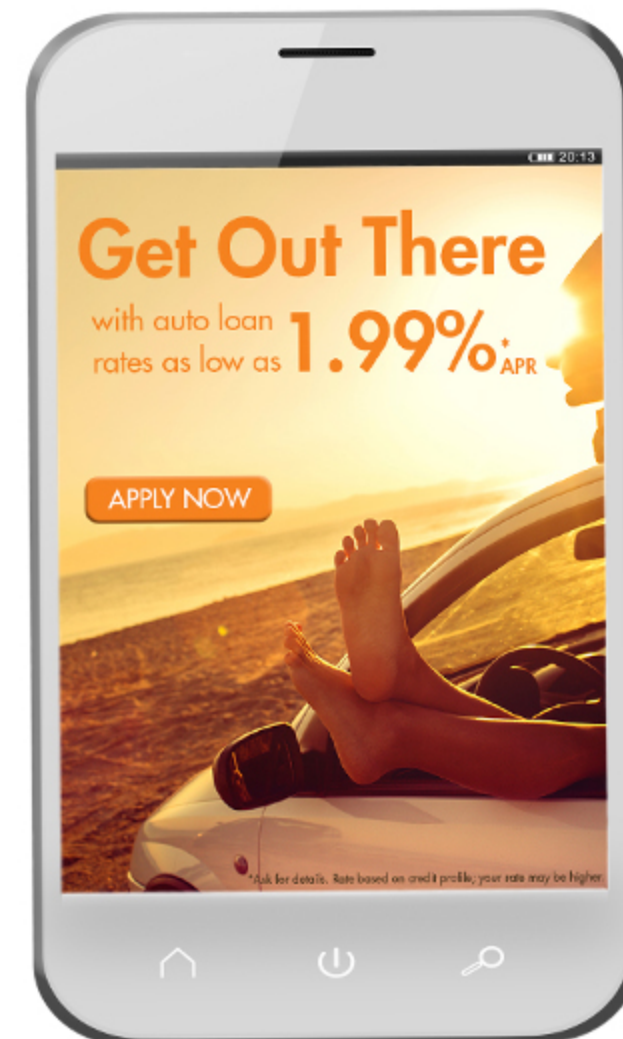
MOBILE SPLASH SCREEN